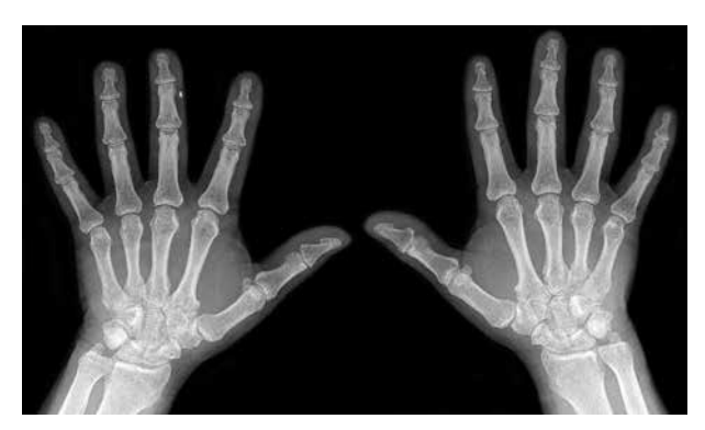
Figure 2. Anteroposterior radiographs of both hands: Soft tissue swelling and metal artifacts due to previous trauma.