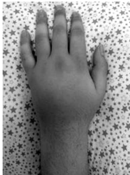
Figure 1. Arthritis of left wrist.

Gonococci are transmitted by sexual contact, mainly through mucosal membranes. DGI is rare and occurs in 0.5-3.0% of patients infected with N. gonorrhoea . 1 It generally occurs several days to two weeks after primary genital infection. Asymptomatic mucosal infection is thought to be the predisposing factor for dissemination in