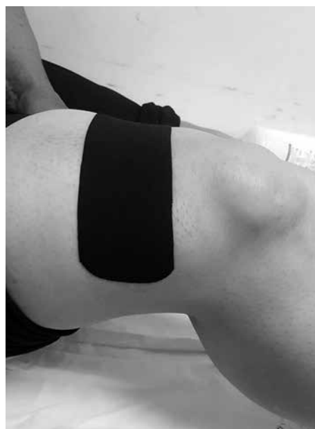
Figure 3. Sham-kinesiology taping application.

Mustafa Kemal University, Tayfur Ata Sökmen Faculty of Medicine Ethics Committee (no. 17, dated 01.03.2016). A written informed consent was obtained from each patient. The study was conducted in accordance with the principles of the Declaration of Helsinki.