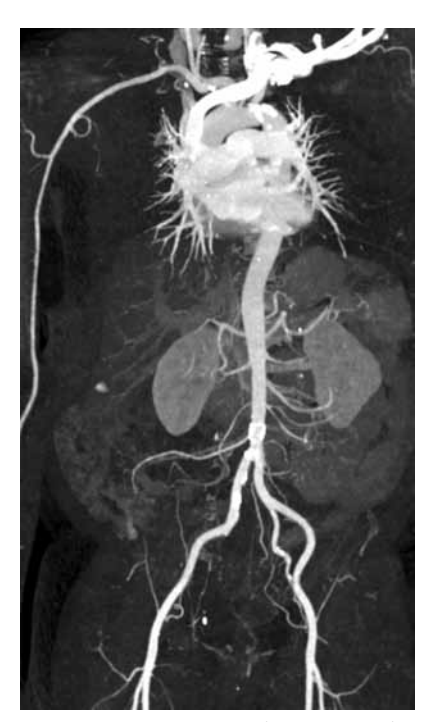
Figure 1. Computed tomography angiography of thoracic and abdominal vessels.

no evidence of vessel aneurysms or stenosis (Figure 1). The temporal artery biopsy (TAB) revealed dense mixed inflammatory infiltrate