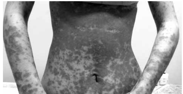
Figure 1. Multiple erythematous, squamous, annular plaques of varying sizes are seen on upper arms and trunk.

Subacute cutaneous lupus erythematosus is a subtype of lupus erythematosus, characterized by polycyclic annular erythematous plaques and limited systemic involvement. Drug induced subacute cutaneous lupus erythematosus (DI-SCLE) mostly affects adults and often occurs on sun-exposed areas. 1 DI-SCLE has been shown to be associated with a large number of drugs including calcium channel blockers, statins, and proton pump inhibitors. 2 Although the patients with autoimmune diseases have been shown to be more prone to DI-SCLE, the exact pathogenesis of DI-SCLE remains unknown. Anti-Ro/SSA