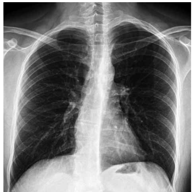
Figure 3. Normal chest X-ray at ninth month of initiation of golimumab.