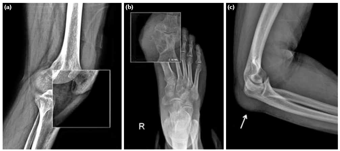
Figure 1. Radiographic findings of gout. (a) Lateral knee radiograph shows thickening of patellar tendon (magnified view in region of interest); (b) anteroposterior view of foot demonstrating soft tissue tophus at big toe and articular subchondral erosion at interphalangeal joint (magnified view in region of interest); (c) lateral radiograph of elbow demonstrating swelling of olecranon bursae (arrow).

American College of Rheumatology/European League Against Rheumatism gout classification criteria scoring 17/23.