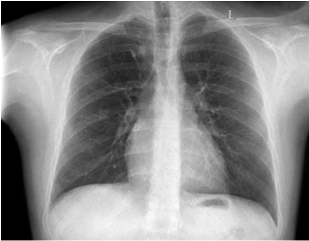
Figure 1. Chest X ray showing left parahilar opacity.

antibodies, and anti-neutrophil cytoplasmic antibodies were negative. Hereditary coagulation thrombophilic factors were normal.