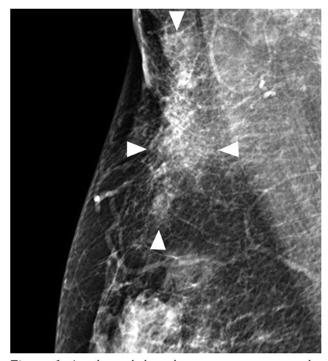
Figure 1. A right mediolateral view upon mammography showing an ill-defined, isodense lesion (arrow heads) interspersed with fat densities in the right axilla.

Furthermore, primary systemic sclerosing lipogranulomas may be associated with underlying systemic diseases such as lipid metabolism disorders, diabetes mellitus, and nephritic syndrome, which may cause lipid accumulation in tissues.<sup>2</sup> Allergic mechanisms have also been suspected as an underlying cause of primary sclerosing lipogranuloma.<sup>3</sup> T-cell mediated immune responses were proposed as the mechanism responsible for the formation of primary lipogranuloma of the scrotum.<sup>3</sup> In some cases, endogenous lipid degeneration related directly or by allergic mechanisms to heat, cold, and trauma has also been suggested as a