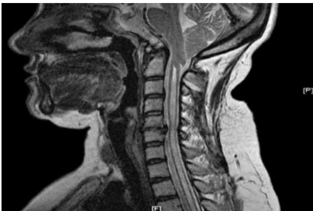
Figure 5. Craniocervical magnetic resonance imaging (FLAIR sequence) showing the syringomyelia.

Neurological symptoms develop according to the location and length of the syrinx. At first, sensory impairment occurs followed by numbness, burning,