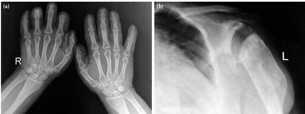
Figure 2. X-rays showing the destructive changes in (a) the hands and (b) the shoulder joint.

limits, and, the cerebrospinal fluid (CSF) results after lumbar puncture were also normal.