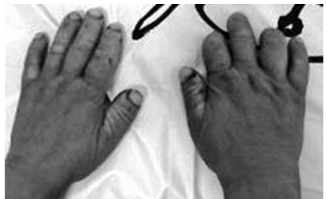
Figure 1. Changes and acral mutilations in the patient's hands.

The patient's laboratory examination revealed the following: white blood cell (WBC): 15,400, hemoglobin: 9.8 g/dl (range 11-18 g/dl), hematocrit: 27.5% (range 35-57%), mean corpuscular volume (MCV): 70.3 fL (range 80-99 fL), erythrocyte sedimentation rate (ESR): 43 mm/hour, iron: 21 ug/dl (range 50-170 ug/dl), antistreptolysin O (ASO): 357 IU/ml (range 0-200 IU/ml), and C-reactive protein (CRP): 24.4 mg/l (range 0-5). In addition, the results were within normal limits for the liver, kidney, and thyroid function tests, and the cardiac enzyme, B12, and folic acid levels were also normal. A complete urinalysis also showed no abnormalities. Furthermore, the hepatitis and vasculitis indicators were negative as were the tests for Brucella, Salmonella, and syphilis. Moreover, the immunofluorescence and protein electrophoreses were also within normal