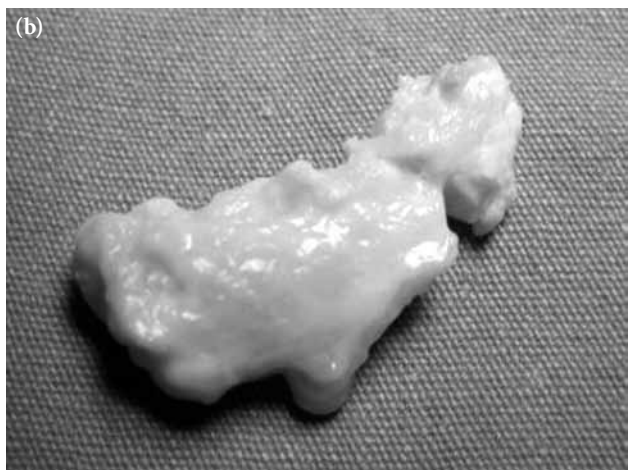
Figure 2. Macroscopic view of the mass (a) intraoperatively and (b) after the excision.