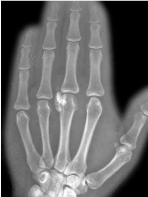
Figure 1. Image of a smooth, bordered mass with calcium deposits in the third metacarpophalangeal joint of the right hand.

of the total cases, and 90% of these occur in the postmenopausal period during the first attack. [9]