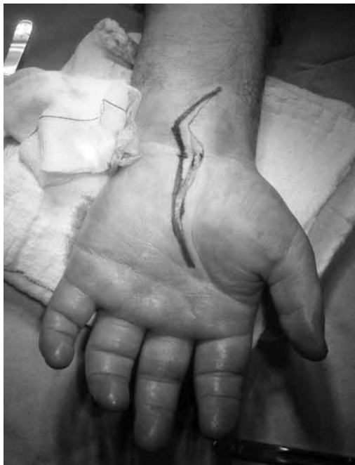
Figure 1. A classic, lengthened carpal tunnel decompression incision located more proximally than the norm.

profundus. It was decided that surgical intervention via a synoviectomy was the best course of action because of the swelling around the tendon sheaths. A classic, lengthened carpal tunnel incision was performed which allowed for the decompression of