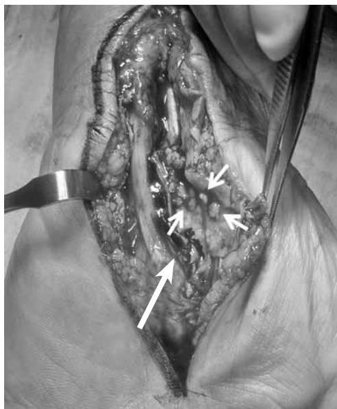
Figure 3. The large arrow shows the median nerve. The small arrows show the multiple rice bodies.

all of the affected tendon sheaths (Figure 1). At the beginning of the operation, a swollen capsular mass was detected on the proximal edge of the wound that mimicked volar wrist ganglia. The capsule was opened, the cold abscess-like fluid drained, and rice bodies were detected. The swollen capsular mass was suspected to be a part of tuberculous tenosynovitis (Figures 2 and 3). Afterwards, a complete tenosynovectomy with extensive debridement of the surrounding granulation tissue