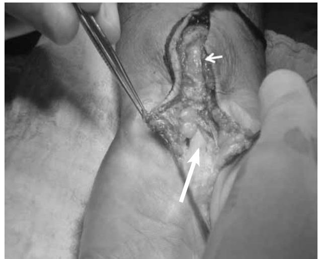
Figure 2. The large arrow shows the median nerve. The small arrow shows a swollen capsular mass.

profundus. It was decided that surgical intervention via a synoviectomy was the best course of action because of the swelling around the tendon sheaths. A classic, lengthened carpal tunnel incision was performed which allowed for the decompression of