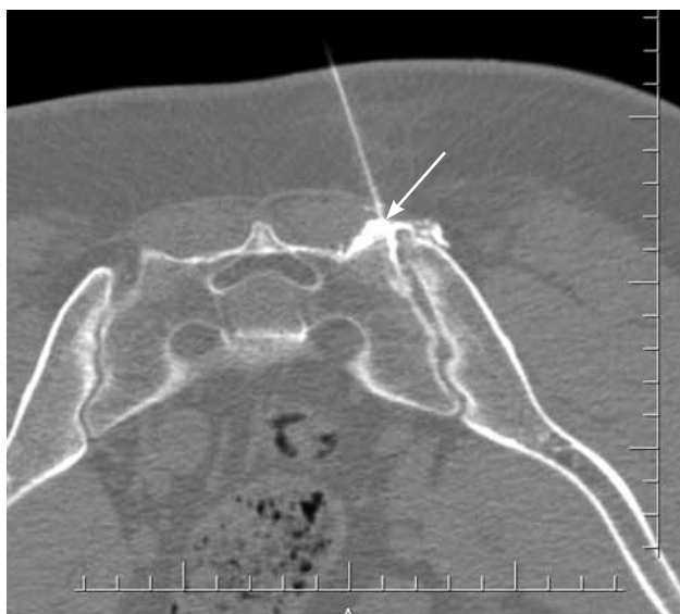
Figure 3. Axial tomography image obtained after the injection of contrast material. Note the intrarticular infiltration of contrast material with dorsal bulging of the posterior sacroiliac ligament (arrowhead) and without evidence of extraarticular distribution.