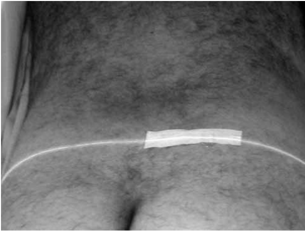
Figure 1. Positioning the computed tomography table. Note the marker and laser indicator showing the exact location of the right sacroiliac joint.

consent was obtained from all patients. Five patients were lost to follow-up; therefore, a total of 46 patients (18 males, 28 females) were evaluated for the final analysis.