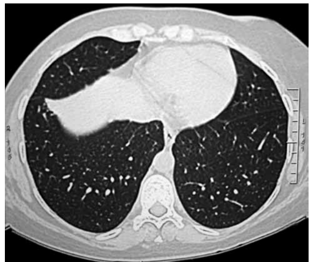
Figure 2. High resolution computer tomography revealed the bilateral hilar lymphadenopathy and multiple mediastinal lymphadenopathy along with several nodules adjacent to several irregular nodules in both lungs. This was compatible with stage II sarcoidosis.

tomography (HRCT) revealed the bilateral hilar lymphadenopathy (LAP) and multiple mediastinal LAP along with several nodules adjacent to several irregular nodules (the largest was 2.5x1.5 cm) in both lungs, which was compatible with stage II sarcoidosis (figure 2). Using a gallium-67 whole body screening method, an activity enhancement in both the hilar and mediastinal regions was consistent with lymph node involvement. The diagnosis of sarcoidosis was confirmed by a bronchoscopic biopsy. A pelvis radiograph and sacroiliac magnetic resonance imaging (MRI) were performed, and the results were normal. The patient was diagnosed as having Löfgren's syndrome, which is a clinical subtype of acute sarcoidosis involving acute arthritis, LAP, and EN. Steroid treatment was administered, and recovery was observed on the arthritis of the right ankle and EN after two weeks. On follow-up, the clinical and laboratory findings (ESR, 35 mm/h; CRP, 7.89 mg/dl) had improved dramatically. During the clinic management of the patient at three months, the patient complained about hip pain, so a radiograph of the sacroiliac joint was performed again. Sclerosis was shown in the inferior regions of both sacroiliac joints on the sacroiliac X-ray (figure 3), and right sacroiliitis was found on the MRI of the sacroiliac joints (figure 4). The complaints of the patient were address by administering nonsteroidal anti-inflammatory drugs (NSAIDs), and the patient continued to be followed up.