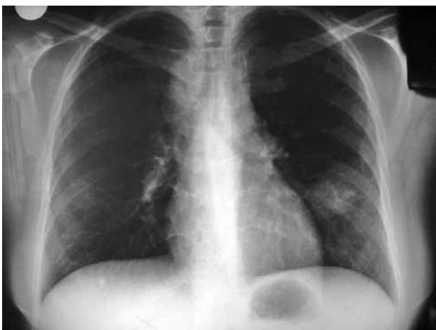
Figure 1. The posterior-anterior chest X-ray demonstrated the bilateral hilar lymphadenopathy.

The laboratory testing results were as follows: rheumatoid factor (RF), 11 U/ml (0-20); erythrocyte sedimentation rate (ESR), 67 mm/h (0-20); C-reactive protein (CRP), 85.43 mg/dl (0-5); and the total blood count, urea, creatinine, and electrolyte values were normal. The hepatitis, antinuclear antibody (ANA) along with the Salmonella and Brucella titers were all negative. The purified protein derivative (PPD) skin and pathergy tests were also negative. No findings were detected on the throat culture or in the direct fecal and parasite examinations. HLA-B27 was negative. A chest X-ray showed the hilar plentitude (figure 1). High resolution computed