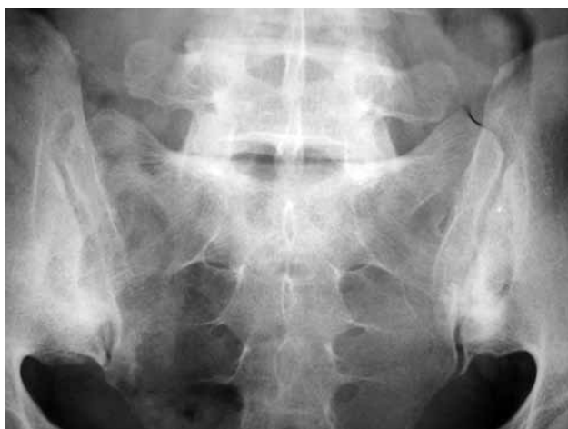
Figure 3. Sacroiliac X-ray showed sclerosis in the inferior regions of both sacroiliac joints.