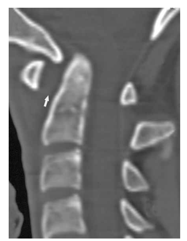
Figure 2. Sagittal computed tomography showing atlantoaxial subluxation.