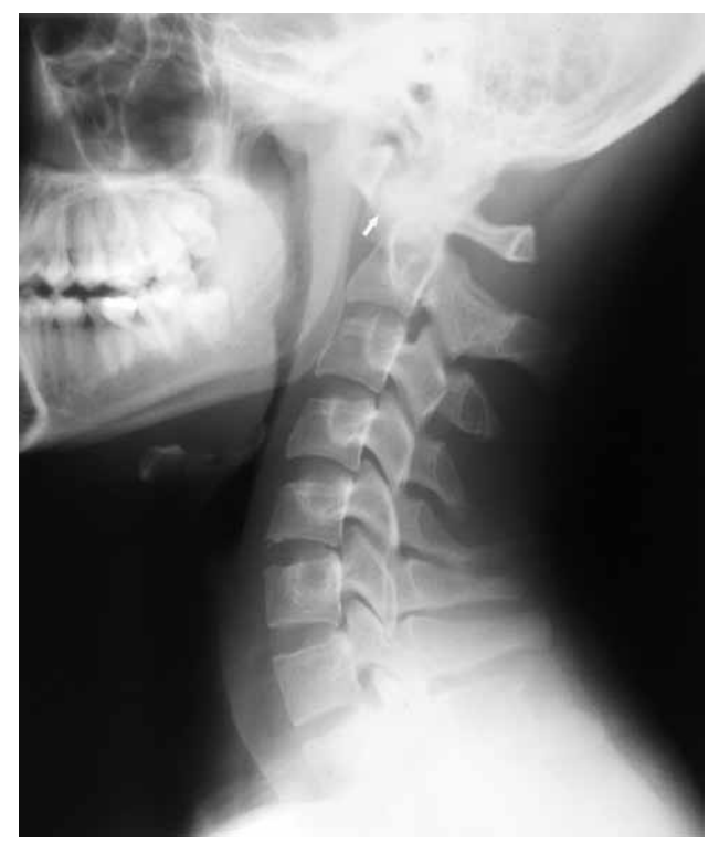
Figure 1. Lateral cervical X-ray demonstrating atlantoaxial subluxation.

The patient was placed in a Philadelphia collar and received a week-long course of intravenous cefazoline sodium treatment. This was followed four days later by a posterior sublaminar fusion of the cervical 1-2 (C1-C2) with an iliac bone graft and the installation of a cervical hard collar for three months. An intraoperative biopsy was planned to confirm the diagnosis and to rule out the possibility of tuberculoma. A pathological examination showed a non-specific inflammatory reaction associated with Grisel's syndrome. Adequate stabilization could not be achieved by the operation. The patient consulted