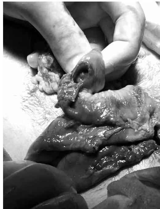
Figure 2. Total ileum and colon resection were applied and jejunostomy was performed.