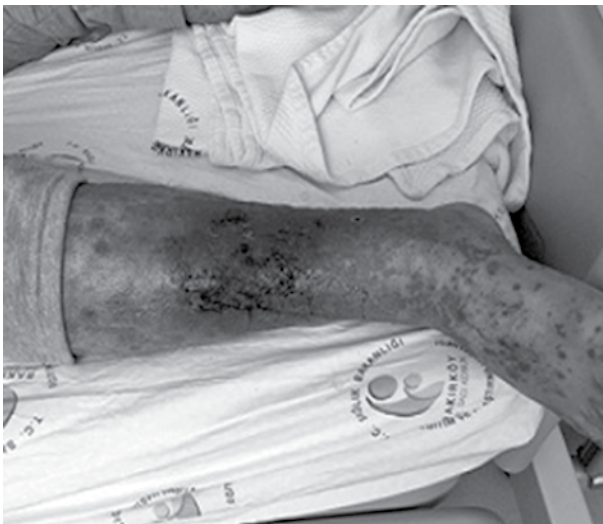
Figure 1. Necrosis of soft tissue in lower extremity due to vasculitis.

tenderness. Laboratory studies demonstrated hyperkalemia (6.0 mEq/L), metabolic acidosis, respiratory alkalosis and anion gap acidosis, as well as acute kidney injury (blood urea