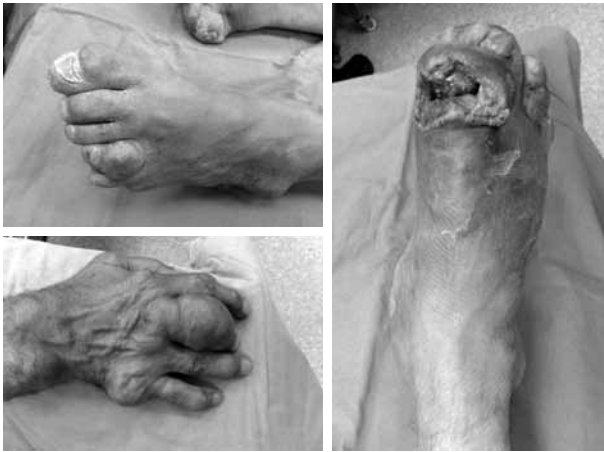
Figure 1. Open wound with skin necrosis and a greyish, large and ulcerated nodule containing chalky material is seen on right toe including 1/2 distal of metatarsal bone (right), tophi on hands, feet, wrists, and ankles (right and left).