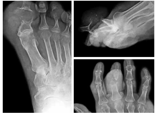
Figure 2. Radiographs of patient. Destructive changes on interphalangeal joint and adjoining metatarsal simulating a malignant tumor on first finger of right foot (left and upper right), a similar lesion is seen on proximal interphalangeal joint of third finger of left hand (lower left).

inflammatory process with foreign body giant cells which is compatible with gouty arthropathy. Ampicillin sulbactam (2 gr/day) and intravenous administration of paracetamol (4 gr/day) were initiated. Non-steroid anti-inflammatory agents could not be used because of the impaired renal function. A low protein diabetic diet with 2000 calories daily was ordered. The patient improved clinically and was discharged.